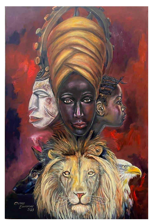
Duality of Time, Oliver Enwonwu (2023)

The painting portrays two human heads and a mask above a dog, a lion and eagle. According to Enwonwu, the animal heads represent "the three elements of time: the past, present and future, with the dog symbolizing the past, the lion representing the present and the eagle, the future."